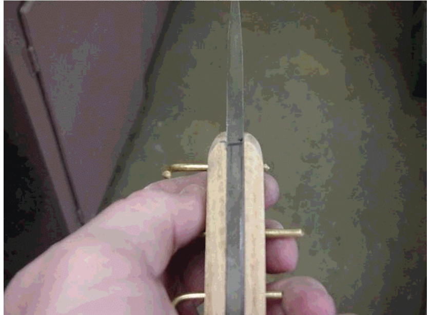
Free image hosting courtesy of www.photopoint.com