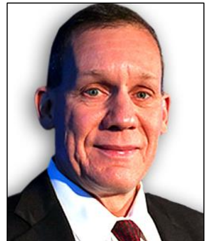
Figure 5: Harvard-NIH-DARPA nanotechnology biowarfare Professor Charles M. Lieber, indicted on Feb. 27, 2020. His nanotube technology is being used in the current COVID poisons being injected in the global population. Lieber was heavily funded by Anthony S. Fauci at NIH. A whistleblower confirms Fauci's participation in DoD biotech weaponization programs .

On Jan. 28, 2020, the federal government indicted Harvard/Chinese nano-biowarfare researcher Dr. Charles M. Lieber in Boston. Lieber holds 66 U.S. patents in nanotechnology, much of it funded by Dr. Anthony S. Fauci and the National Institute of Health (NIH) as well as Harvard, DARPA, MITRE Corporation, Air Force Office of Scientific Research and the Office of Naval Research (each patent delineates the federal agencies that funded Lieber in the "Government Interests" section).