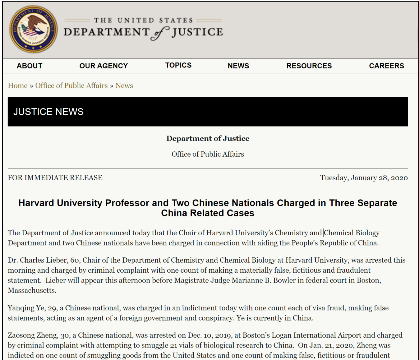
Figure 6: Press Release. (Jan. 28, 2020). Harvard University Professor and Two Chinese Nationals Charged in Three Separate China Related Cases. U.S. Department of Justice, accessed Sep. 14, 2021. Source: https://www.justice.gov/opa/pr/harvard-university-professor-and-two-chinese-nationals-charged-three-separate-china-related